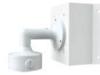
NAV-DJB + NAV-BPB + NAV-SAC