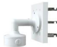
NAV-DJB + NAV-BPB + NAV-SAS